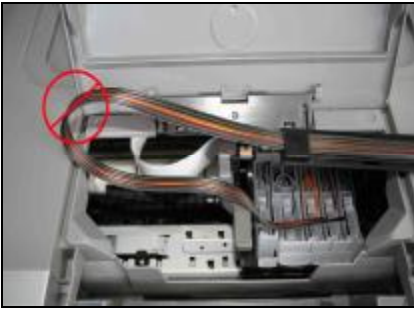
1. Too long Tube